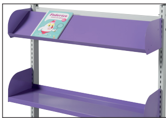
Ref. 3052 and Ref. 3051